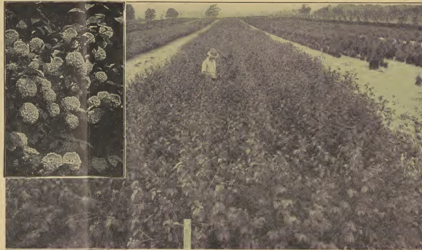
A "talking" picture of VIBURNUM PLICATUM (Japan Snowball). It says "Noted for QUALITY since 1897" (Photographed September 22, 1930)